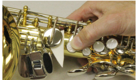
Adjusting pearl arm down and pad cup up.