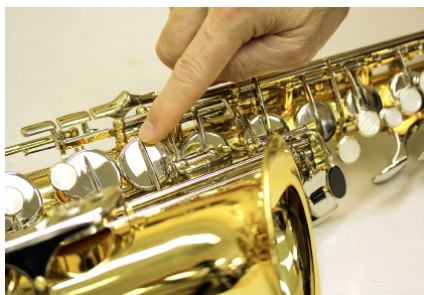
Secondary RH F#.