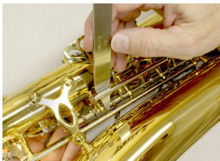
Lifting back bar of F#.