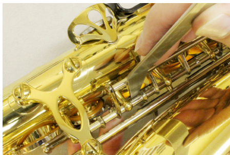
Adjusting back bar down.