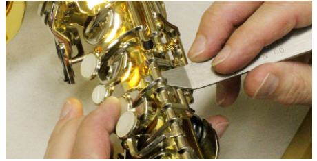
Holding B-Key and flexing back bar.

For example, if the C is under-adjusted from either the B or A, we'll work only on the C. We'll use the