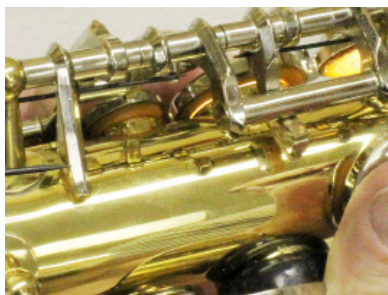
Over-adjusted LH B.