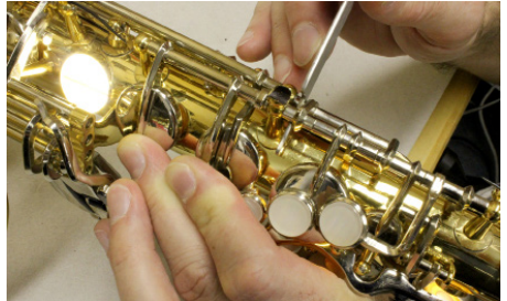
Holding A-Key and flexing foot from C back bar, with step end turned up.