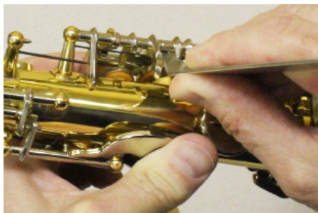
Reducing angle of C-Key arm.

Touch pieces can be aligned using a post as a fulcrum.