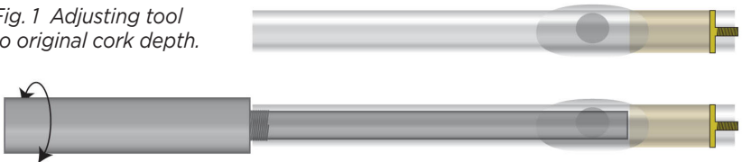
Fig. 1 Adjusting tool to original cork depth.

Insert the “B” tool into the headjoint, and adjust the rod until the end touches the cork, and the headjoint rests against the tool.